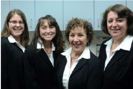
The Family Center Audiologists

Our dedicated audiologists have been providing quality hearing evaluations and hearing aid services to the community since 1961. We serve all ages, from newborn infants to seniors with individualized care in a comfortable, professional, safe and friendly environment.