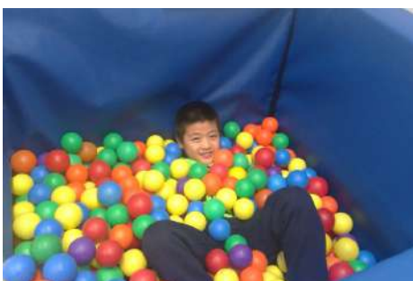
Our services are both therapeutic and fun!

Our clinicians have expertise providing expert, individualized Occupational Therapy, Speech-Language Pathology, and Testing, Tutoring, and Counseling for children of all ages. Each child's therapy is based on a thorough evaluation and individualized treatment plan created by a licensed clinician. Weekly feedback is provided to parents and our clinicians collaborate with outside professional/teachers in support of each child's development. At the core of our program philosophy is the belief that our clinicians treat children, not disabilities.