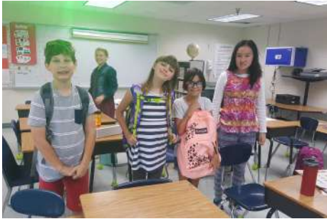
KTS Lower-Middle School Students

Since its founding in 1995, KTS has earned a solid reputation for providing an exceptional educational experience to students in preschool through 12th grade with language and learning disabilities, autism, intellectual disabilities, &/or other health impairments. Multi-disciplinary teams comprised of special educators, teacher assistants, speech-language pathologists, social workers, occupational therapists, and physical therapists provide our students with a unique blend of educational and therapeutic services while implementing a positive success-orientated curriculum.